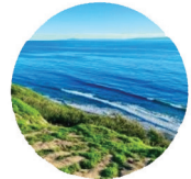
1998: Carpinteria Bluffs