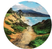
2005: Sperling Preserve