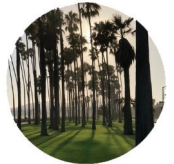
1996: The Douglas Preserve