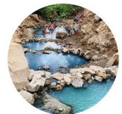
2015: Veronica Meadows