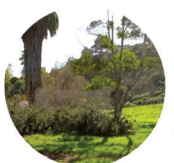
Continue the Legacy 2021: San Marcos Foothills West Mesa