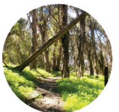
2012: Hot Springs Canyon